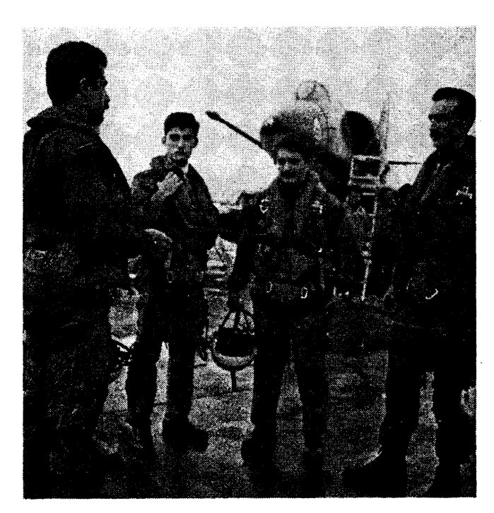
Argentina's "Cruz" air squadron prepares to leave on a mission during the Malvinas War. Today, a plan is afoot to dismantle the armed forces of all the nations of Ibero-America.

The "Panama case" is a clear indication of the intent of the current United States government: to completely eliminate any attempt to defend national sovereignty, especially if supported by national armed forces. While I pursued my military activities, I observed the concern of many United States authorities, and to learn their true intentions, I spoke with many U.S. military commanders, in hopes of avoiding what finally occurred: the invasion of Panama, a true disaster, a total injustice, and aberrant genocide. I still bear great sadness and pain in my heart over that fateful act, inconceivable in the civilized world in which we purport to live.