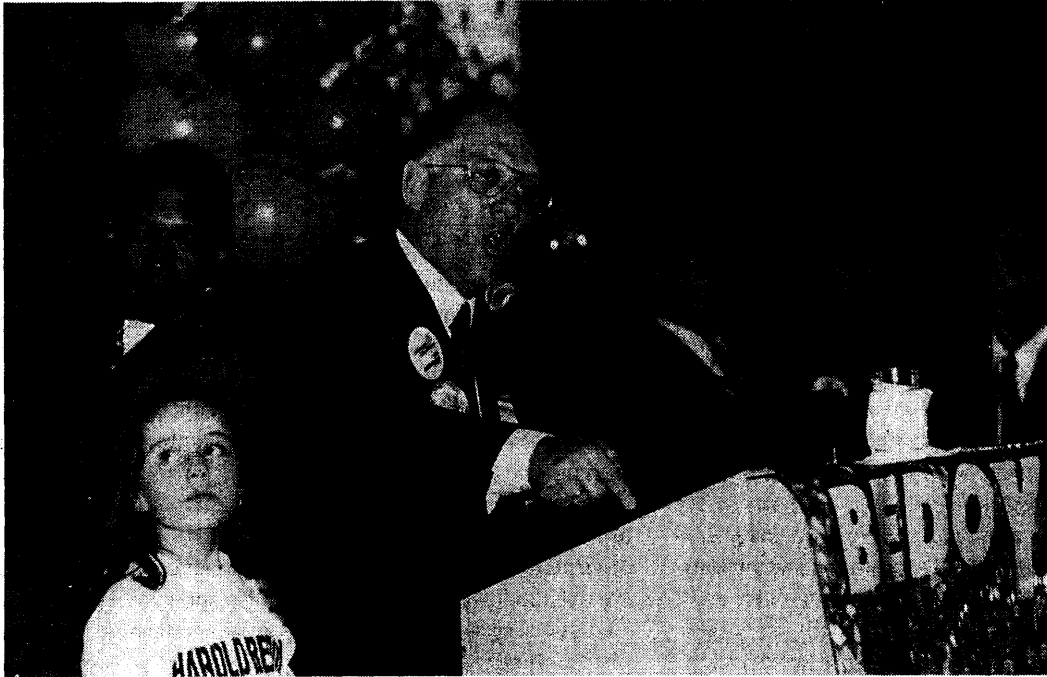
Former Presidential candidate Gen. Harold Bedoya (ret.): "A Marshall Plan is needed, like that with which Europe recovered after World War II. We are talking about a plan to rebuild a country from the ashes."

with its base being Florencia (capital of Caquetá), to cover the southern region: Putumayo, Amazonas, the Amazon region. With this development pole, we could rebuild areas devastated by the drug trade, and we would rehabilitate these zones, putting the land to work once again to grow food instead of drugs, recovering the jungle that was burned or slashed to produce coca, while researching how to exploit the jungles which are very rich in biodiversity. In this project, the whole Colombian government would participate, as well as the United States and other industrialized nations.