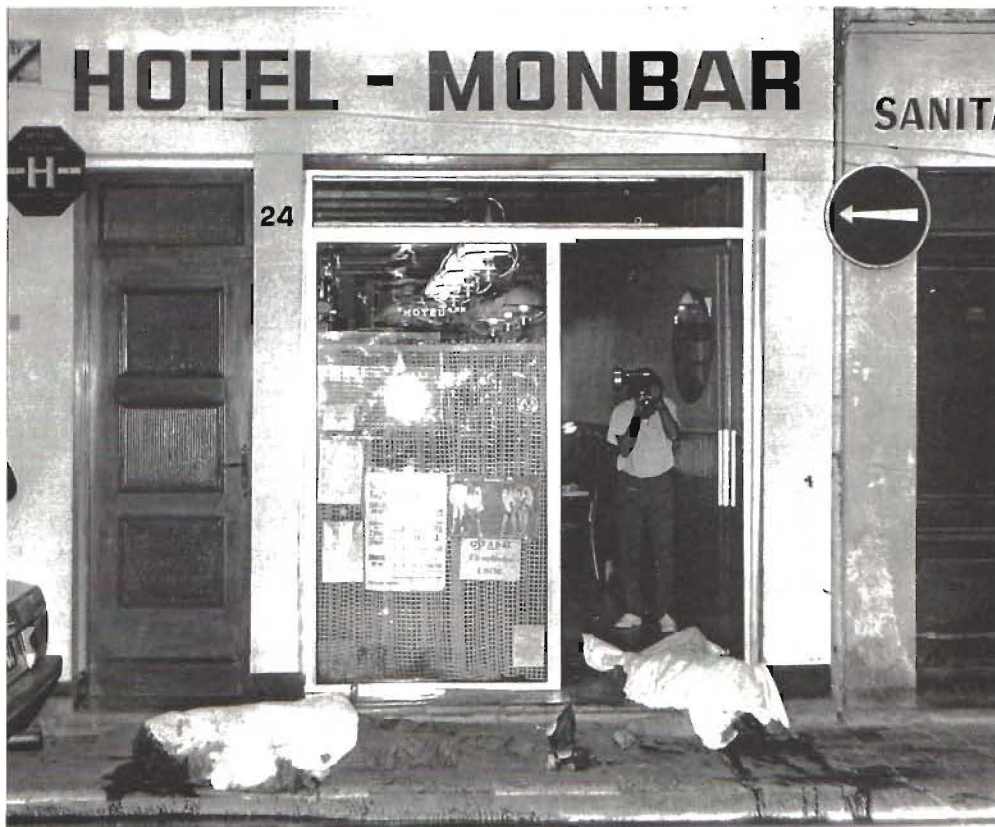
Aftermath of GAL assassination of three ETA members in Bayonne, France, 1985.