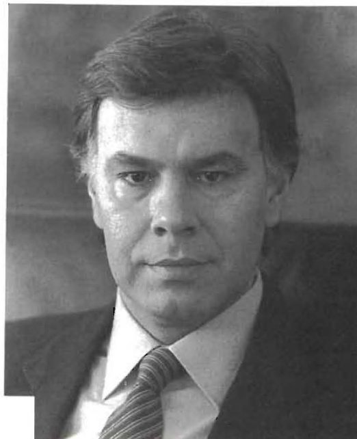
Pres. Felipe González. "Democracy defends itself in the courts and in the conference rooms, but also in the sewers."

istence of government-sponsored hit squads when he told the press that "there are societies in which they have come to legalize this counter-terrorism, like in Israel, where terrorist activities carried out abroad are supported and directed by the State." 14