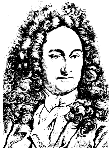
From left: Karl Gauss, Johannes Kepler, G.W. Leibniz. The scientific tradition represented by these men formed the basis for LaRouche's understanding of the way in which the revolutionary new weapons now emerging accomplish their nonlinear effects.

cance of such weapons among relevant senior military specialists of several nations with which I have been in communication.