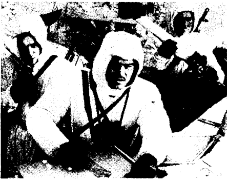
Soviet spetsnaz forces are trained to operate in Arctic climates.

Soviet spetsnaz forces are specially selected on criteria not only of physical strength and stamina, but also cleverness and cunning, and, extremely important, language skills. They are given the most rigorous training possible. The training not only includes expertise in the art of silent assassination with silencer pistols, long-range rifles with telescopic sights, and chemical- and gas-spray pistols, and expertise in the use of all types of demolitions, but also extremely rough, long-term survival courses in all types of wilderness—deserts, mountains, arctic climates. A regular feature of the training is the air dropping of a spetsnaz unit in inhospitable terrain, with the orders to reach a designated point up to hundreds of kilometers away, and successfully carry out a sabotage mission there. All spetsnaz soldiers are expert parachutists and swimmers, and those assigned to the four spetsnaz naval brigades are expert divers.