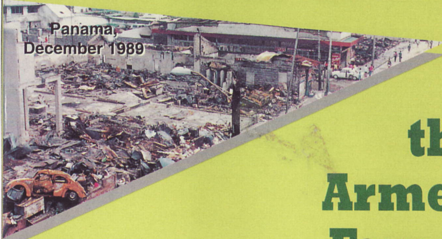
Panama, December 1989