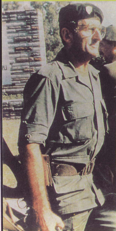
Colonel Mohamed Alf Seineldin